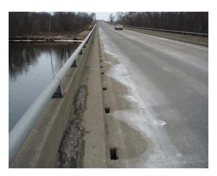
Figure 6 (above): Contaminants such as road salt enter waterbodies quickly from impervious surfaces such as roads.